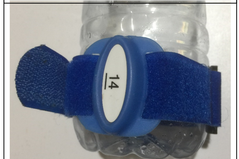
PIC 2 – This strap will come off