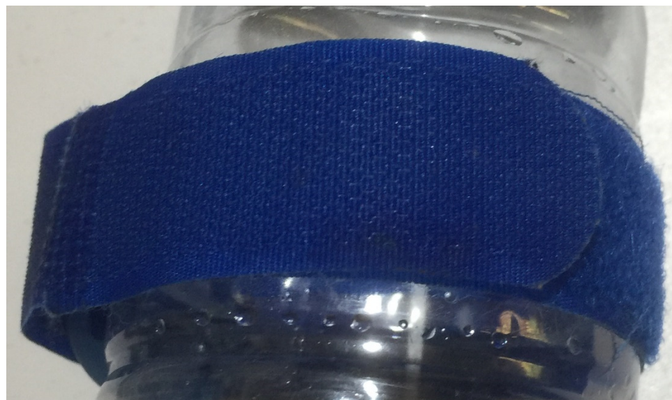
PIC 6 The entire 60mm velcro hook end grips the velcro loop AFTER the blue housing PIC 7